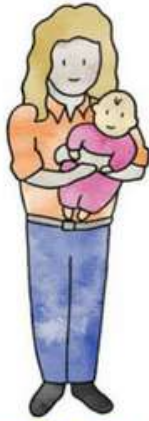
Family in Crisis

Parents in need voluntarily approach SFFC through a self-referral or other referral sources. They can opt to reunify with their children at any time and never lose custody of their children.